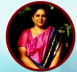
Dr. Tessy Thomas 21st April

Pariksha Parv 7.0 Live Streaming sessions from 21st March 2025 to 21st April 2025 between 3:00 PM to 4:00 PM*