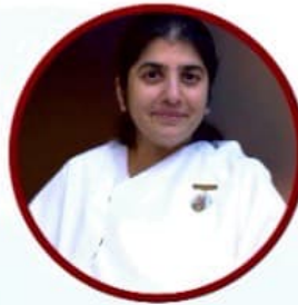
Sister BK Shivani 25th March Timing- 11:00 AM to 12:00 PM*