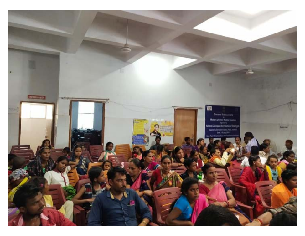
People from different places with their Complaints on Child Rights.