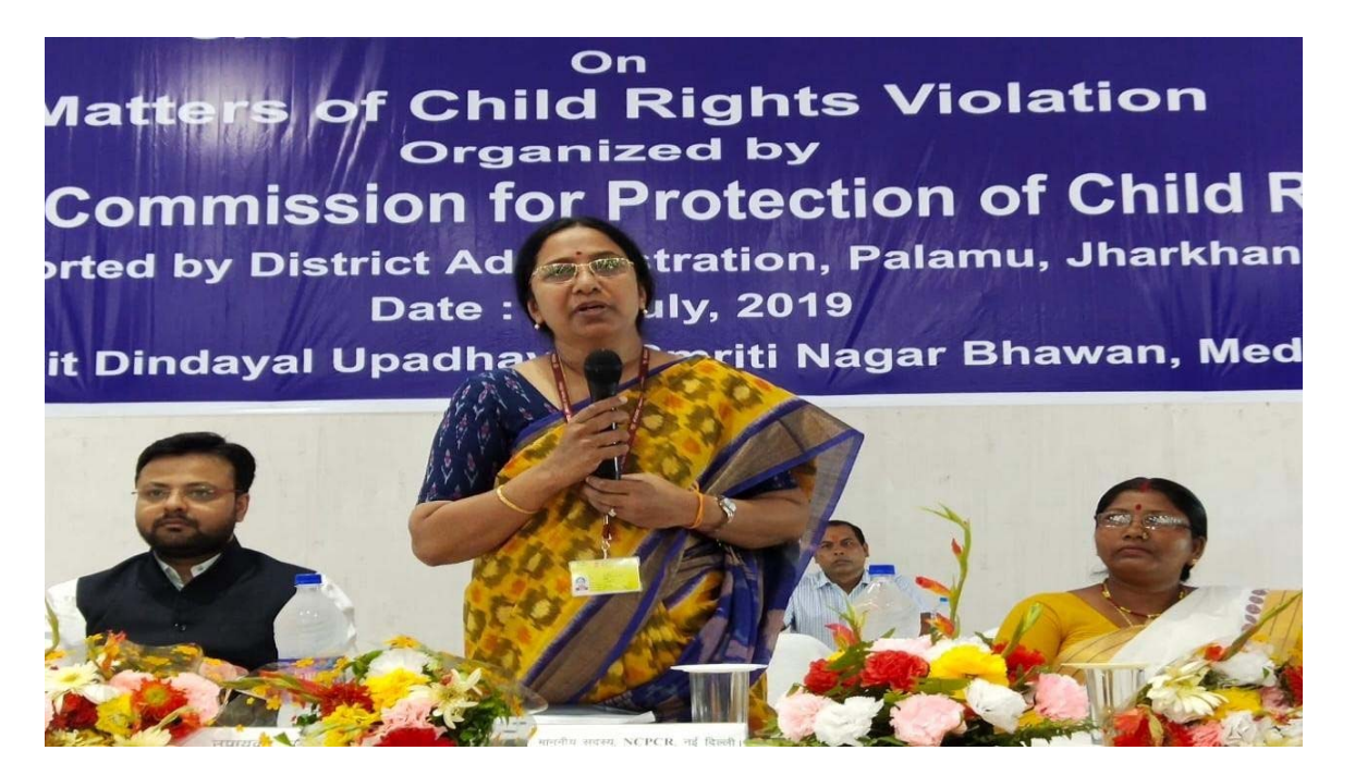
Introduction and Preceding of the Camp