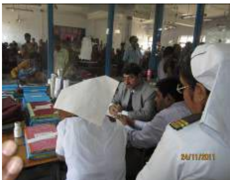
While checking the records, team observed that in absence of requisite number of nursing staff the proper updates history were inconsistent in the files

As well as the Maternal Ward. Against a sanctioned strength of 50 beds in the general paediatric ward , the patients present were 82 at the time of the visit of the team. The scene inside the ward looked too chaotic with free for all situation and on some