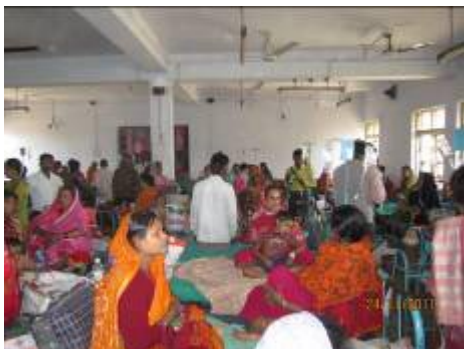
Overcrowded children's ward

As well as the Maternal Ward. Against a sanctioned strength of 50 beds in the general paediatric ward , the patients present were 82 at the time of the visit of the team. The scene inside the ward looked too chaotic with free for all situation and on some