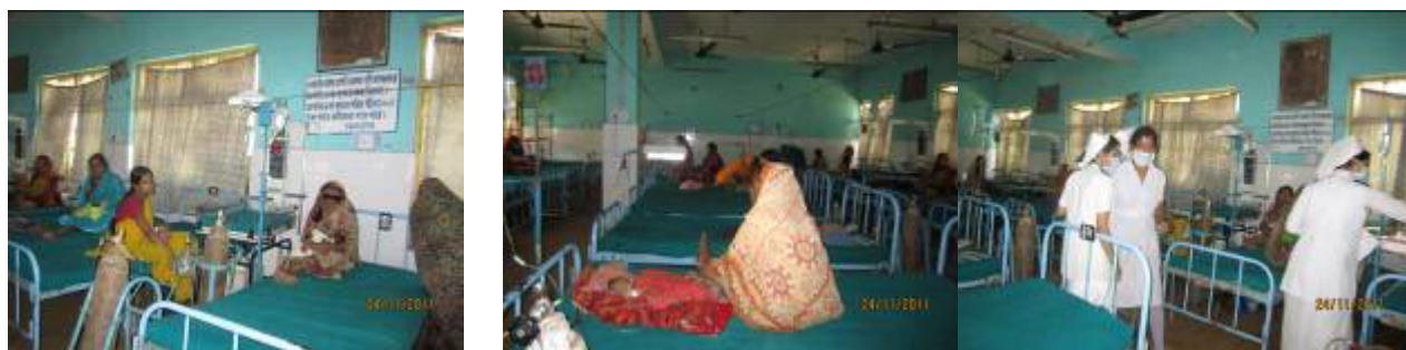
Freshly painted walls of neo-natal ward; neatly kept beds and minimal patient admission; nurses with face mask.

On visit to the neonatal ward , the team was surprised to see the freshly painted walls of the ward, well kept beds and minimal number of patients. As against a sanctioned strength of 30 beds, only 19 beds were occupied, the beds were well kept and clean, and on insistence by the team to be supplied with the face masks, the nursing staff too applied the masks on their faces. On being asked whether the hand sanitizers were being used, the sister in-charge responded in affirmative and pointed out towards the half cut soap in a stinging wash room behind the nursing station, referring to it as the hand sanitizers . It later transpired that the hospital had