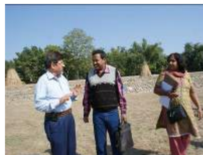
Journey to Narayanpur char with the help of Boat and Tractor.