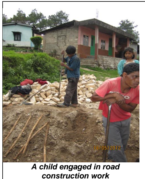
A child engaged in road construction work

On way to the mining areas of Jaintia Hills, the NCPCR team could see children working in the road construction activities near the Mukunder village. Observing young children engaged in the activities, the two members of the Commission asked the officials from the labour department accompanying them to stop the vehicle and take cognizance of the child engaged in road construction. The members desired that the Deputy Labour Commissioner (HQ) accompanying the members should take necessary action against the Contractor and the Department concerned for engaging child labour.