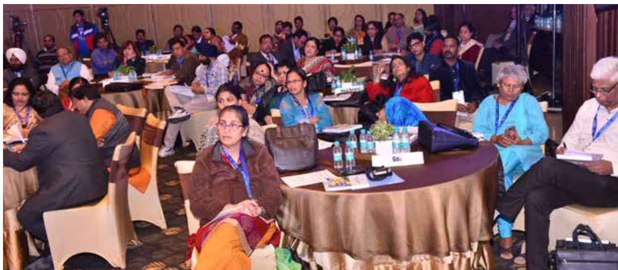
Participants from States

Children from Sexual Offences Act 2012 were detailed. The composition and powers of the Commissions, under Section 13 of the CPCR Act, 2005 were discussed and suggestions made for the effective functioning of the Commissions for grievance redressal, inquiring into complaints, inspections of homes and advocating for children's rights. The need to use the powers derived from the CPCR Act, 2005, judiciously to minimise procedural defects was highlighted. It was suggested that SCPCRs develop a Vision and Mission statement along the lines of the NCPCR document on this.