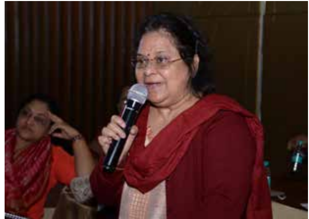
Odisha State Commission

ensure compliance following the registration of Homes.