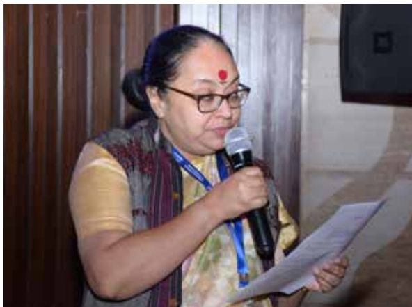
West Bengal State Commission

A comprehensive training for new Members in State Commissions including skill development on interacting with children was requested. Information and training on the recently amended JJ Act, 2015 and the POCSO Act, 2012, SOP on Children Homes as per the J.J. Act, 2015, the development of a compilation of different Supreme Court and High Court judgments related to cases of child rights violation and templates for inspection of Homes/Shelters were other suggestions made. Queries included the follow up for children enrolled in schools under the EWS quota after grade VIII, places of safety, dealing with delay in payment of interim compensation, measures to tackle substance abuse among children and steps to be taken to